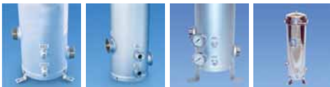
Mounting Tabs (May be installed at site)