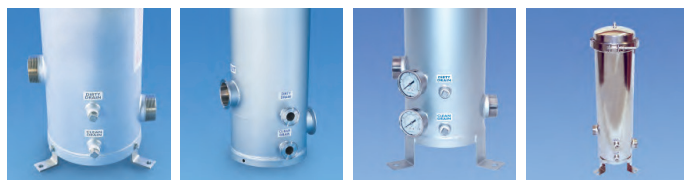
Mounting Tabs (May be installed at site)